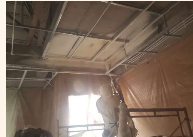
RUMAH TINGGAL JL. WULUH, TOMANG, JAKARTA BARAT