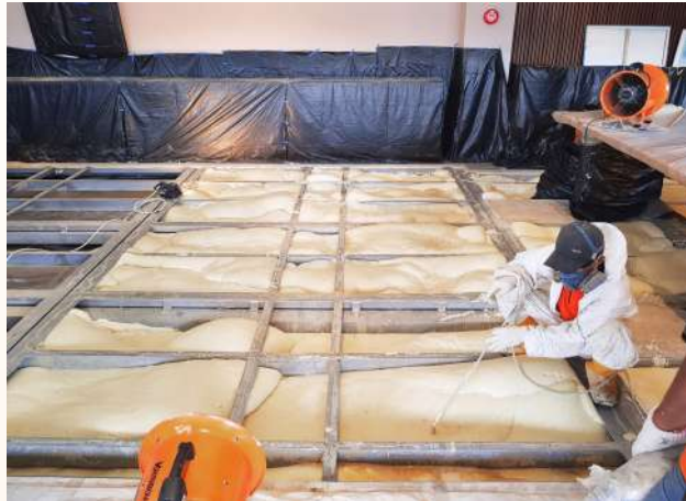
MEREDIAN ADVENTURE HOTEL & RESORT RAJA AMPAT, PAPUA