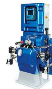
REACTOR 2 H-30, H-40 AND H-50