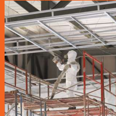
HEAT AND SOUND INSULATION