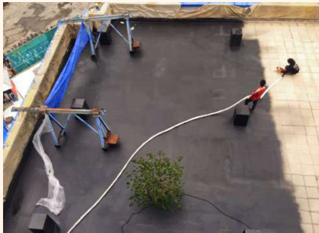
SHOWROOM MERCEDES-BENZ PT. PANJI RAMA OTOMOTIF (PRO MOTOR)