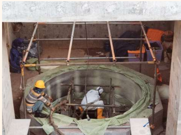
PLTGU TANJUNG PRIOK