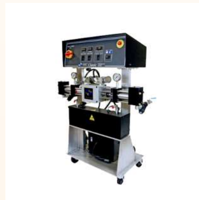
PH-25 2000 PSI (138 BAR)