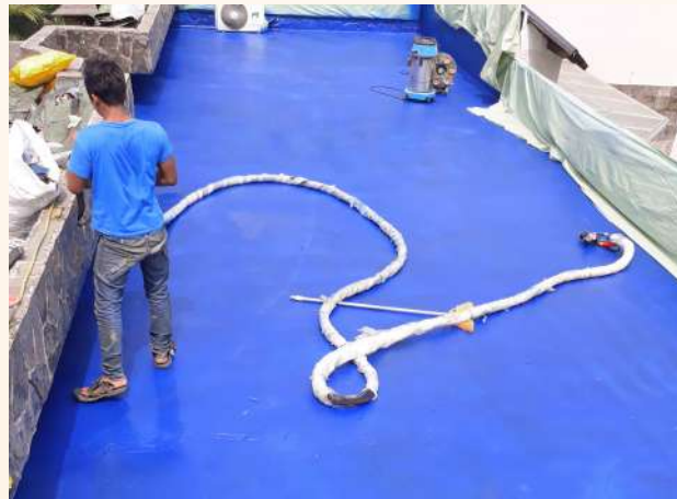
RUMAH TINGGAL DI KOMPLEKS BILLYMOON, PONDOK KELAPA, JAKARTA TIMUR