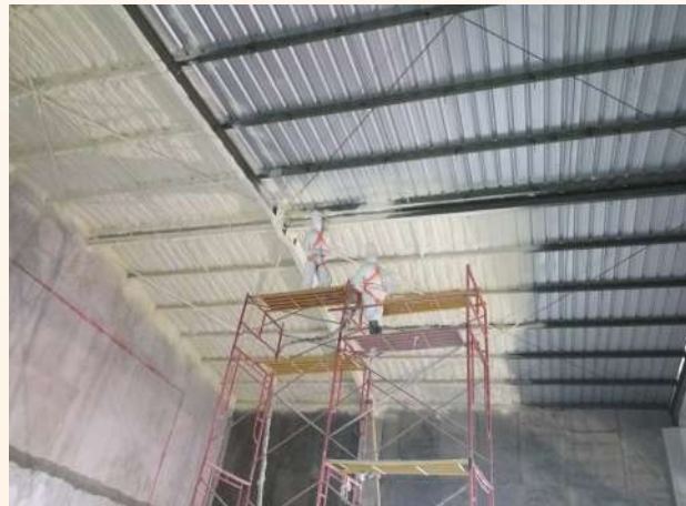
GEDUNG KEUSKUPAN BANDUNG