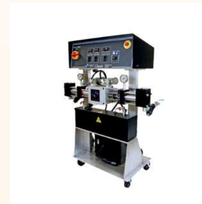
PH-40 2000 PSI (138 BAR)