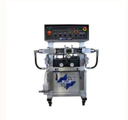
PH-2 2000 PSI (138 BAR)