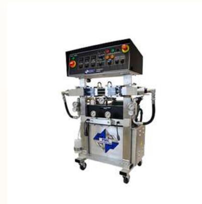
PAX-25 3000 PSI (207 BAR)