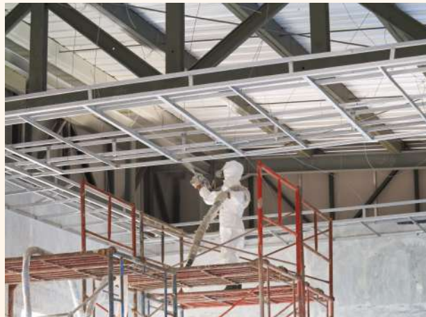
RUMAH SAKIT ST. ANNA, BANDAR LAMPUNG