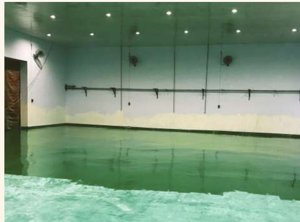
PABRIK MINYAK GORENG, JL. MOH YAMIN, JOMBANG - JAWA TIMUR