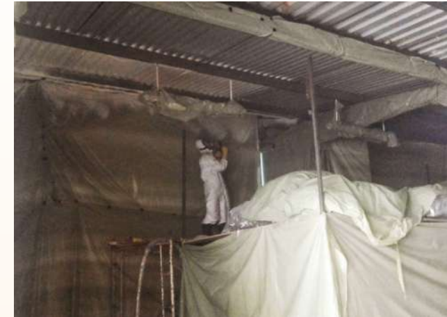
RUMAH TINGGAL JL. LURAH NAMAT, JATIRANGGA, JATISAMPURNA, BEKASI