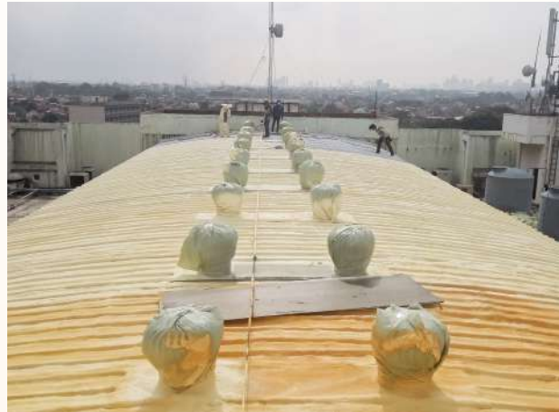
RUMAH SAKIT HAJI PONDOK GEDE