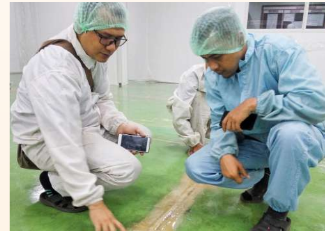
PABRIK PT. PIGEON INDONESIA - SERANG, BANTEN