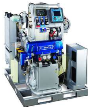
REACTOR 2 E-30I