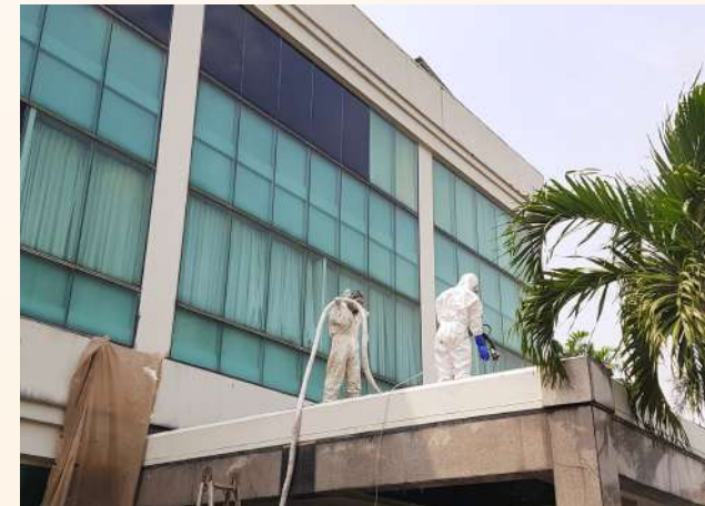
GEDUNG WIKA BETON