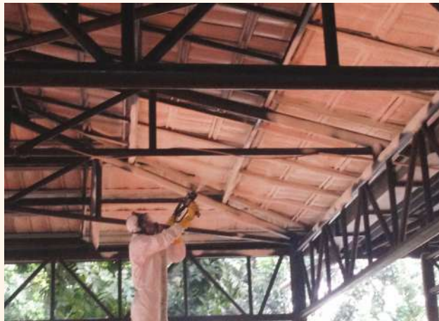
SEKOLAH TAIPEI KELAPA GADING, JAKARTA UTARA