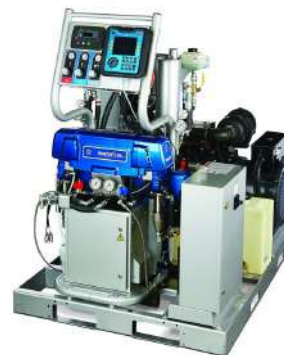
REACTOR 2 E-XP2I