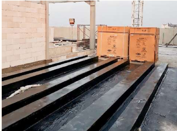
RUMAH SAKIT ST. CAROLUS