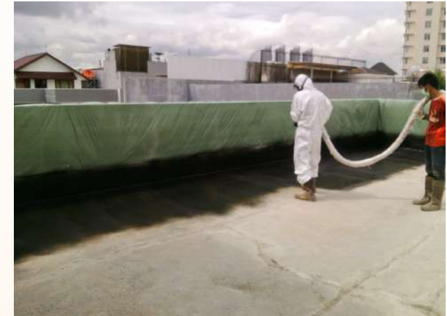
RUMAH TINGGAL DI PANTAI MUTIARA, JAKARTA UTARA