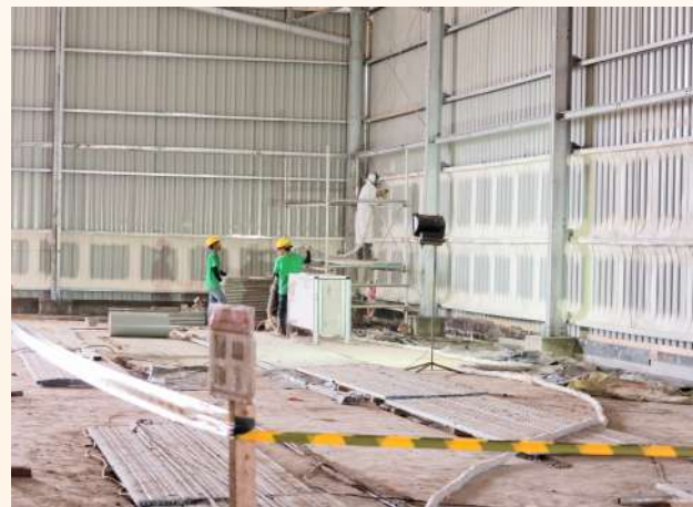
MAIN SUBSTATION BUILDING PT. MEDCO E&P MALAKA - SKK MIGAS - ACEH