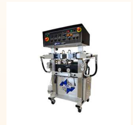
PHX-2 3000 PSI (207 BAR)