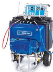
REACTOR E-10 HP